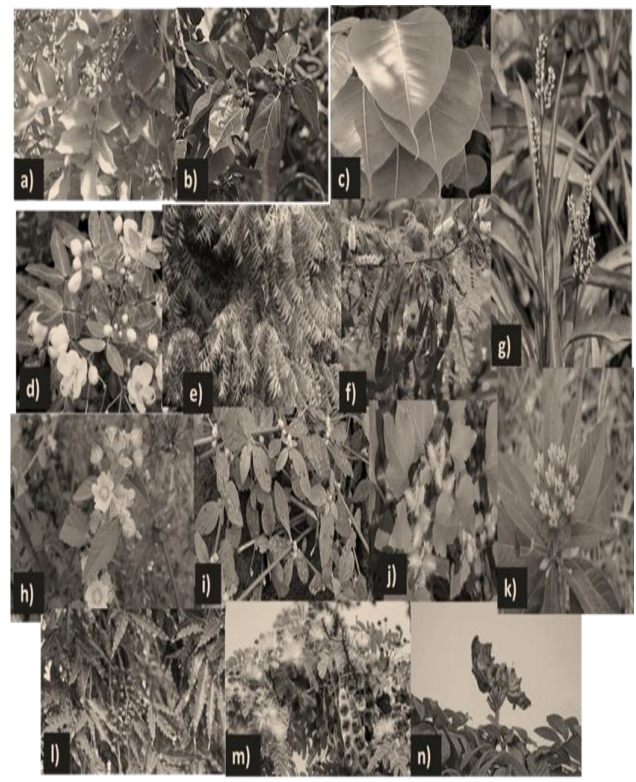
Figure No 2. a) Pongamia glabra b) Ficus benghalensis c) Ficus religiosa d) Cassia sp. e) Azadiracta indica f) Acacia sp. g) Polygonum glabrum h) Sida i) Alternanthera sessilis j) Xanthium strumarium k) Asclepias curassavica l) Polyalthia longifolia j) Albizia lebbeck k) Spathodia campanulata.