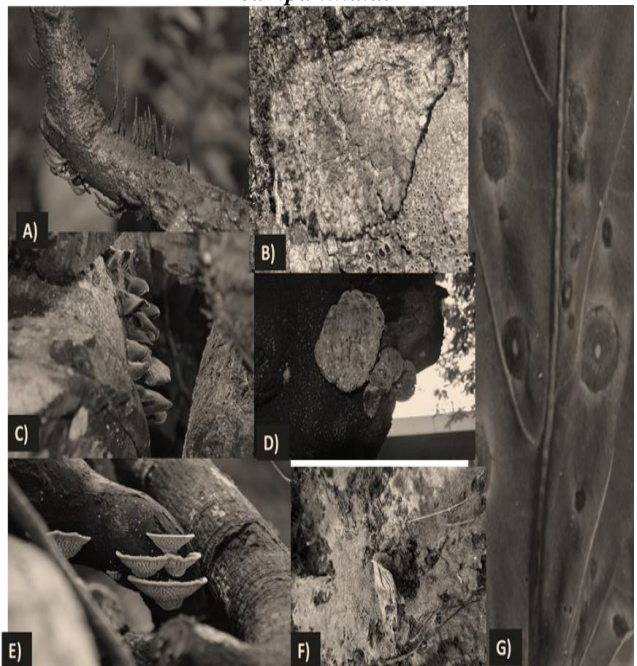
Figure No 3. A) Xylaria, B) Caloplaca, C) Auricularia, D) Inonotus, E) Daedalea, F) Rhizocarpon, G) Cercospora.